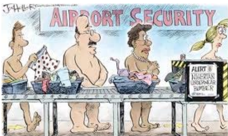
"AFTER THE SHOE BOMBER THEY MADE US REMOVE OUR SHOES... I FIGURE IT WAS ONLY A MATTER OF TIME."